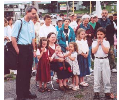
A young family praying outside abortion killing center in Omaha

We, “The Lambs of Christ” are in need of prayer – and your help – and your physical presence at the “Auschwitz of Omaha,” located on Mission Blvd. across from Saint Mary’s School in Bellevue, Nebraska. We gather at 7:30 a.m. on Sat. to say four rosaries and offer up our “Sacrificial Prayer” to Jesus Christ, through Mary, Our Mother – whom Jesus has chosen to lead the counter-attack against Satan!! (See Genesis 3:15 in the original translations which tell us that: “... SHE ... will crush the head of the serpent – and he will lie in wait at ... HER ... heel.”) We offer ourselves and our “Sacrificial Prayer” to Jesus Christ so that He can then bring us and our “Sacrificial Prayer” into union with Himself in The Way of Divine Love to satisfy God the Father’s Divine justice, so as to stop the evil of Satan’s brutal murder of God’s children.